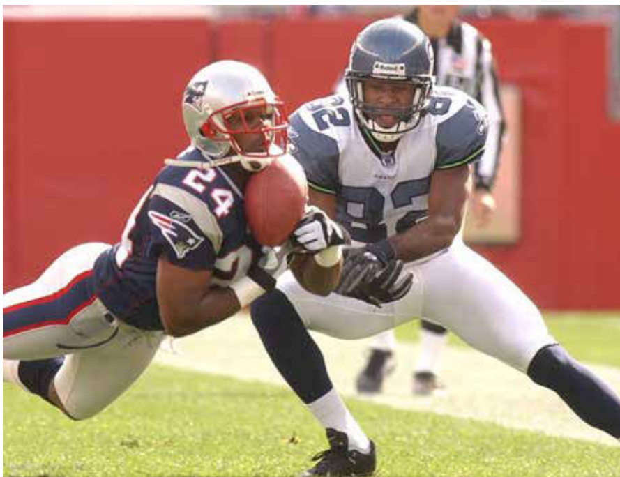
Law finished with 36 interceptions as a Patriot, tying the career mark originally set by fellow Patriots Hall of Famer Raymond Clayborn. He ranks first in team history in interception return yards (583) and interceptions returned for a touchdown (6).

The NFL agreed with that this year, electing Law to the Pro Football Hall of Fame. Along with John Hannah and Andre Tippett,