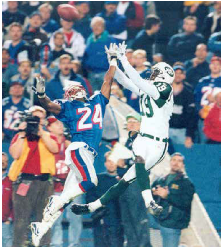
Law, defending Jets WR Keyshawn Johnson, routinely matched up against the opposing team's best wide receiver and came away triumphant.

"I left and played on some different teams but my heart was always with the Patriots," said Law, who left quite a legacy in Foxborough.