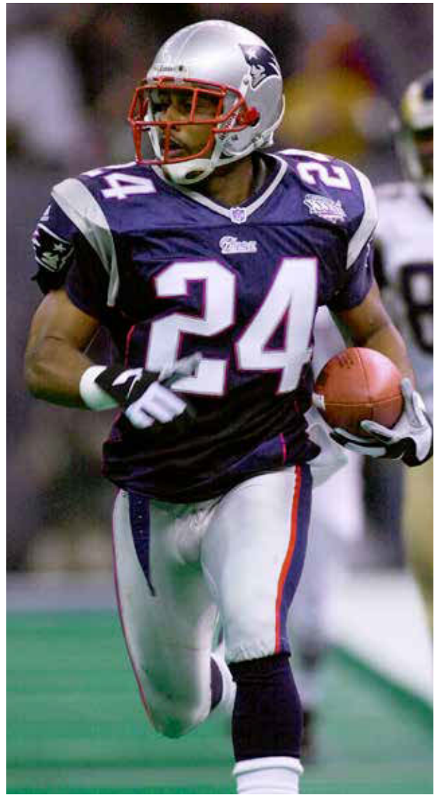
Ty Law's pick six in Super Bowl XXXVI not only got the Patriots on the board but provided a boost of confidence that helped the team upset the Rams and capture their first NFL championship.

F ans and pundits have long debated the provenance of the Patriots dynasty – a remarkable run that includes 16 division titles, nine conference crowns, six Super Bowl championships and more regular and post season wins than any other NFL team over the past 18 years.