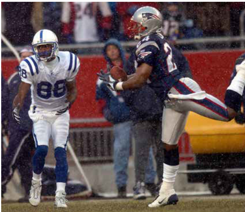
Ty Law's three-interception against Peyton Manning and Colts in the 2003 AFC Championship propelled the Patriots to their second trip to the Super Bowl in three years

"Let's man up and get in their faces," said Law of the game plan to be physical with the Rams receivers. "We just can't let them run all over and do what they've been doing. I stood up and said, 'I got Isaac Bruce.' Otis Smith stood up and said, 'I got Torrey Holt.' Terrell Buckley and Tebucky Jones stood up and said, 'I got him,' and 'I got him.' It changed everything."