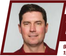
TIM RATTAY QUARTERBACKS