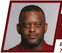
IKE HILLIARD WIDE RECEIVERS