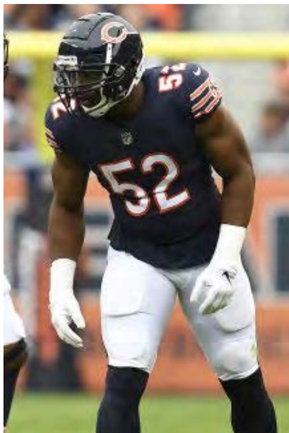
Bears LB Khalil Mack is tied for fifth in the NFC with 5.0 sacks and is tied for first in the NFL with 4 forced fumbles.