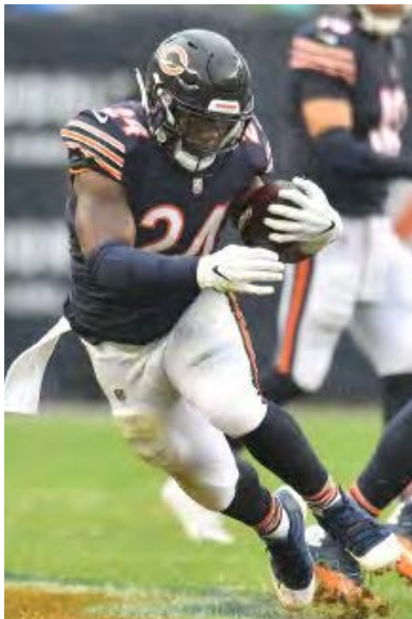
RB Jordan Howard leads Chicago's ground attack and is third in the NFL in rushing with 2,707 yards since the start of 2016.