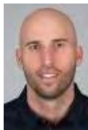
Dave Ragone Quarterbacks