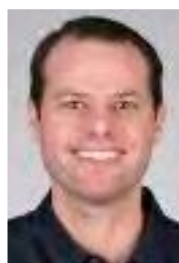
Brandon Staley Outside Linebackers