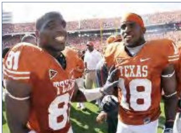
Sam (left) and Emmanuel (right) Acho

Following his playing days, Emmanuel has worked for both the Longhorn Network and Fox 7 as of recent, does public speaking, and hosts a podcast called Beyond the Film Room, which is about the abilities of athletes beyond sports. Acho also participated in a forum with the former Austin police chief meant to reduce divisions between the police and African-American communities.