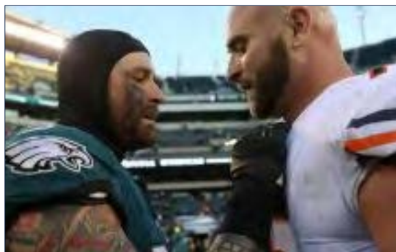
Chris (left) and Kyle (right) Long