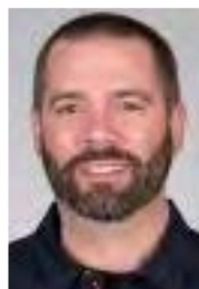
Kevin Gilbride Tight Ends