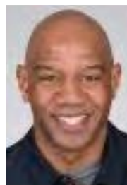
Charles London Running Backs