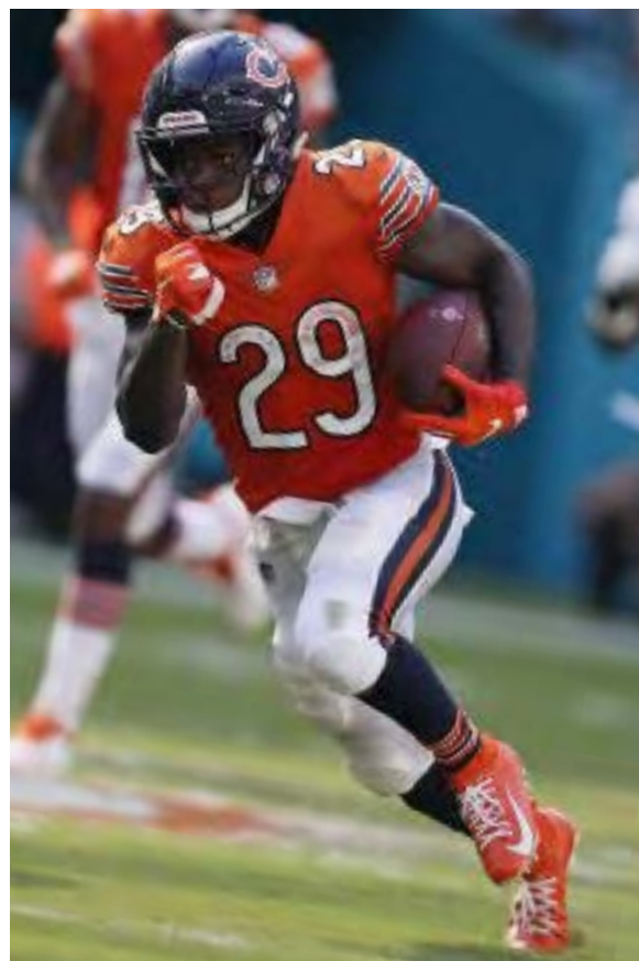
RB Tarik Cohen is fourth in the NFL among running backs with 51.8 receiving yards per game.