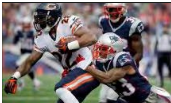
Did you know: Former Bears running back Matt Forte is the only Bears running back to have logged a 100-yard game versus the Patriots, doing so on Oct. 26, 2014 with a 114-yard performance on 19 carries (6.0 avg.) at Gillette Stadium.

Punt Returns: ..... 8 (9/15/85) Punt Return Yards: ..... 71 (9/15/85) Kick Returns: ..... 7 (12/12/10) Kick Return Yards: ..... 196 (12/12/10) PR Touchdowns: ..... NA KR Touchdowns: ..... NA Field Goals Made: .....3 (11/10/02) Field Goal Long: .....46 (11/26/06) Punts: ..... 10 (9/21/97) Punts In20: ..... 2 (2 times, 12/12/10)