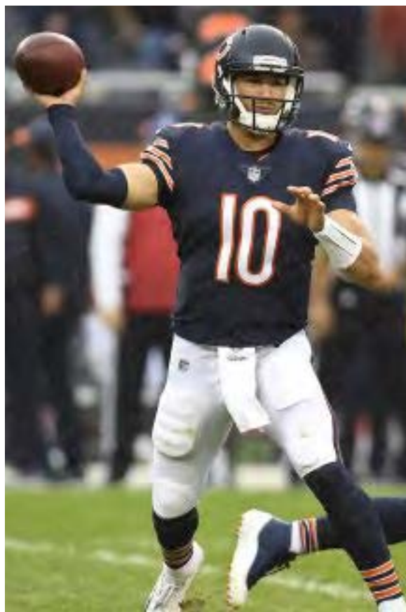
QB Mitchell Trubisky has totaled 770 yards of total offense over the past two games: 670 passing yards (9 TDs, 1 INT) and 100 yards rushing on 11 carries.

limited Tampa Bay's top-ranked offense to just 311 net yards and 10 points.