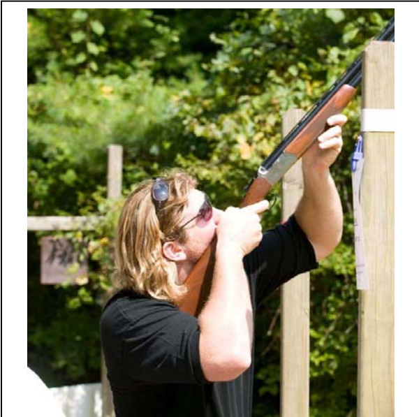
Matt Light takes aim at a sporting clay during his 2007 Matt Light Foundation Celebrity Shoot-Out.

New England Patriots offensive lineman Matt Light hosted his third annual Celebrity Shoot-Out, a clay-shooting event to benefit the Matt Light Foundation on August 31 at Addieville East Farm in Mapleville, R.I.