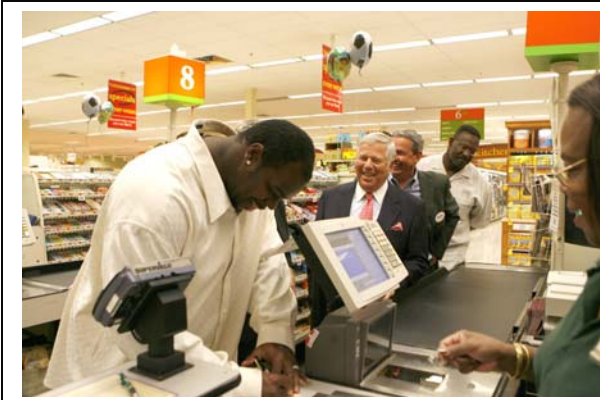
Patriots Chairman and CEO Robert Kraft looks on as Vince Wilfork purchases a gold paper football at Shaw's in Mansfield, Mass. as a part of the Kids Café fundraising campaign. The football, which costs $6.65, will feed a child a hot meal for a week.

The New England Patriots Charitable Foundation, Shaw's Supermarkets and The Greater Boston Food Bank have kicked off a joint fundraising campaign to support local Kids Café programs and food banks throughout New England.